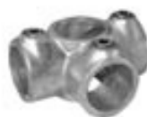
Series 1062 Side Outlet Tee