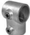
Series 1048 Short Tee