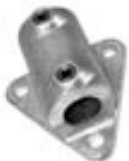
Series 1060 Wall Flange