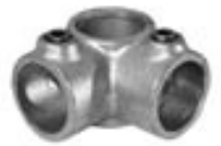
Series 1052 3 Way Open Corner