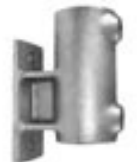
Series 1059 Vertical Base Flange