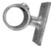
Series 1061 Rail Bracket