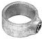
Series 1068 Collar