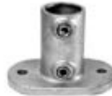
Series 1050 Railing Base Flange