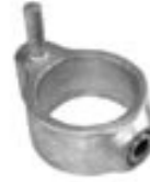
Series 1070 Gate Hinge