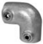
Series 1047 90 Degree Elbow