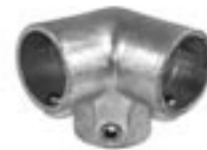
Series 1051 3 Way Blind Corner