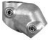
Series 1067 Variable Angle Tee