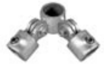
Series 1083 Corner Swivel Kit