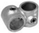
Series 1078 Cross Over