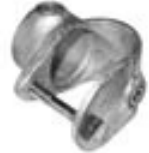
Series 1079 Clamp On Tee