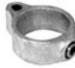
Series 1069 Gate Eye