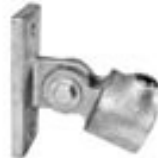
Series 1081 Base Swivel Kit