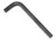
Series 1093 Hex Wrench