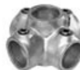
Series 1063 4 Way/Center Pipe