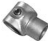
Series 1056 Internal Swivel Tee