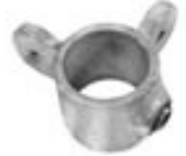
Series 1077 Corner Male Swivel