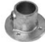
Series 1058 Base Flange